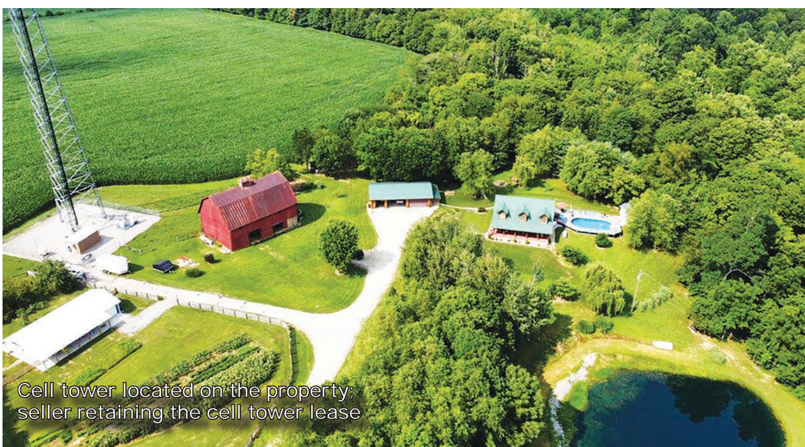
Cell tower located on the property; seller retaining the cell tower lease