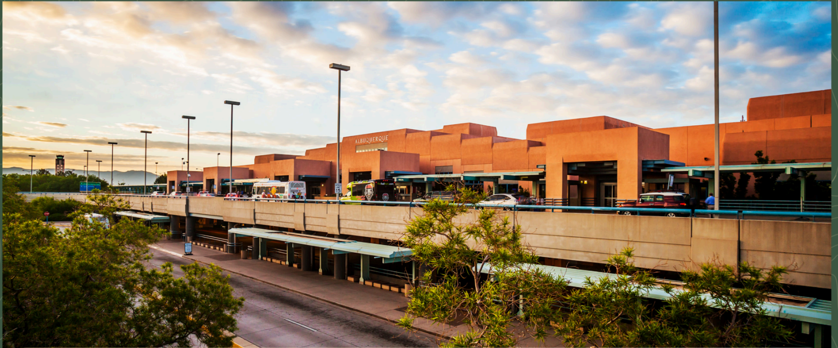
Albuquerque International Sunport